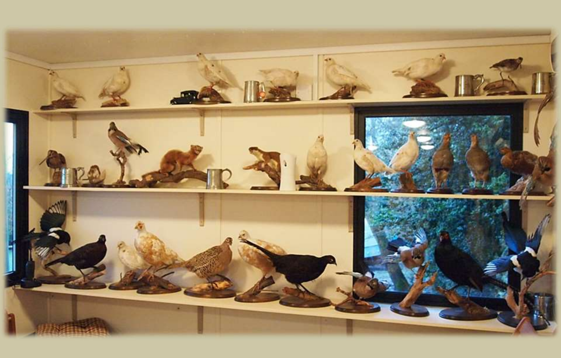
Ripley Shoot Box