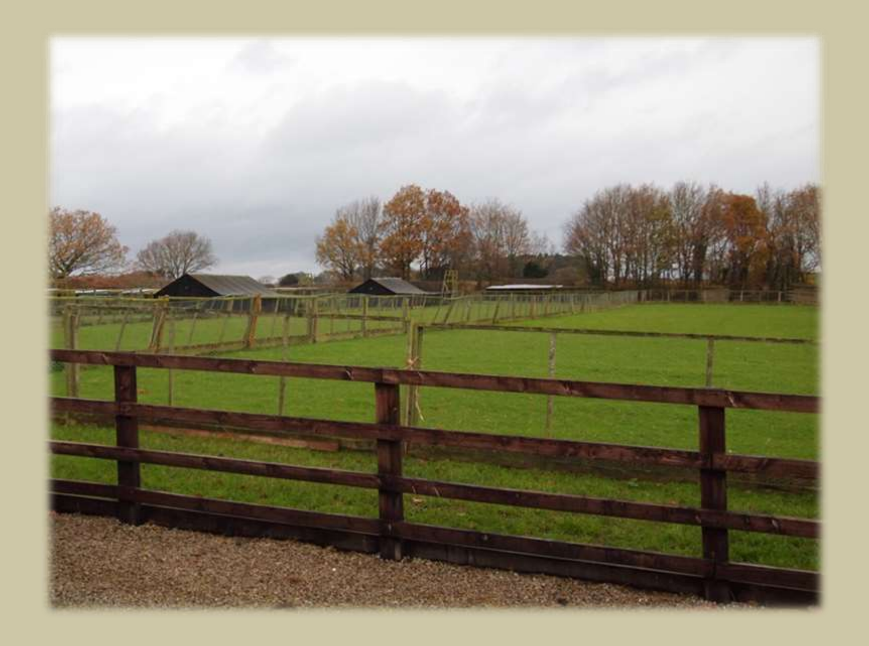
Ripley Pheasant Farmhouses