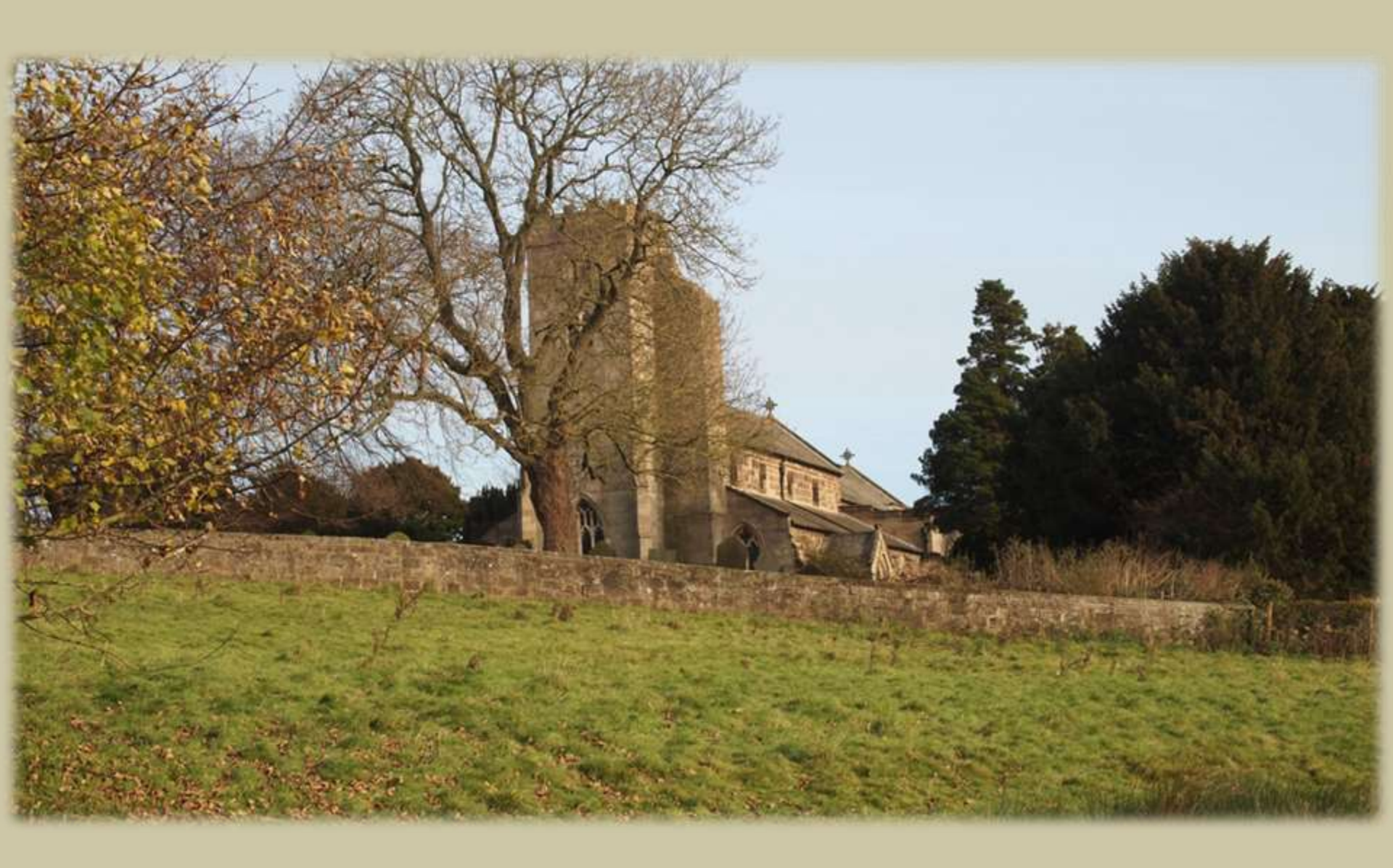
Impressionen Ripley und die nähere Umgebung