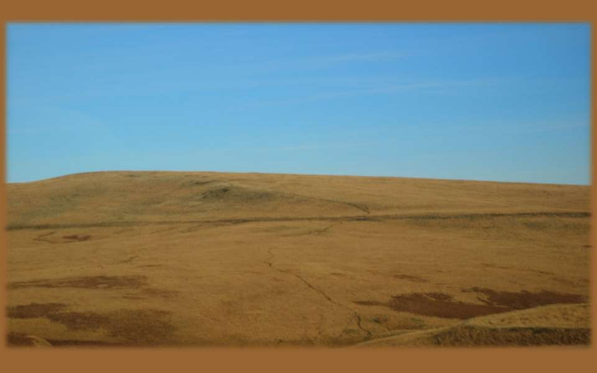
Hochmoor: Impressionen auf der Fahrt vom Airport Manchester nach Ripley