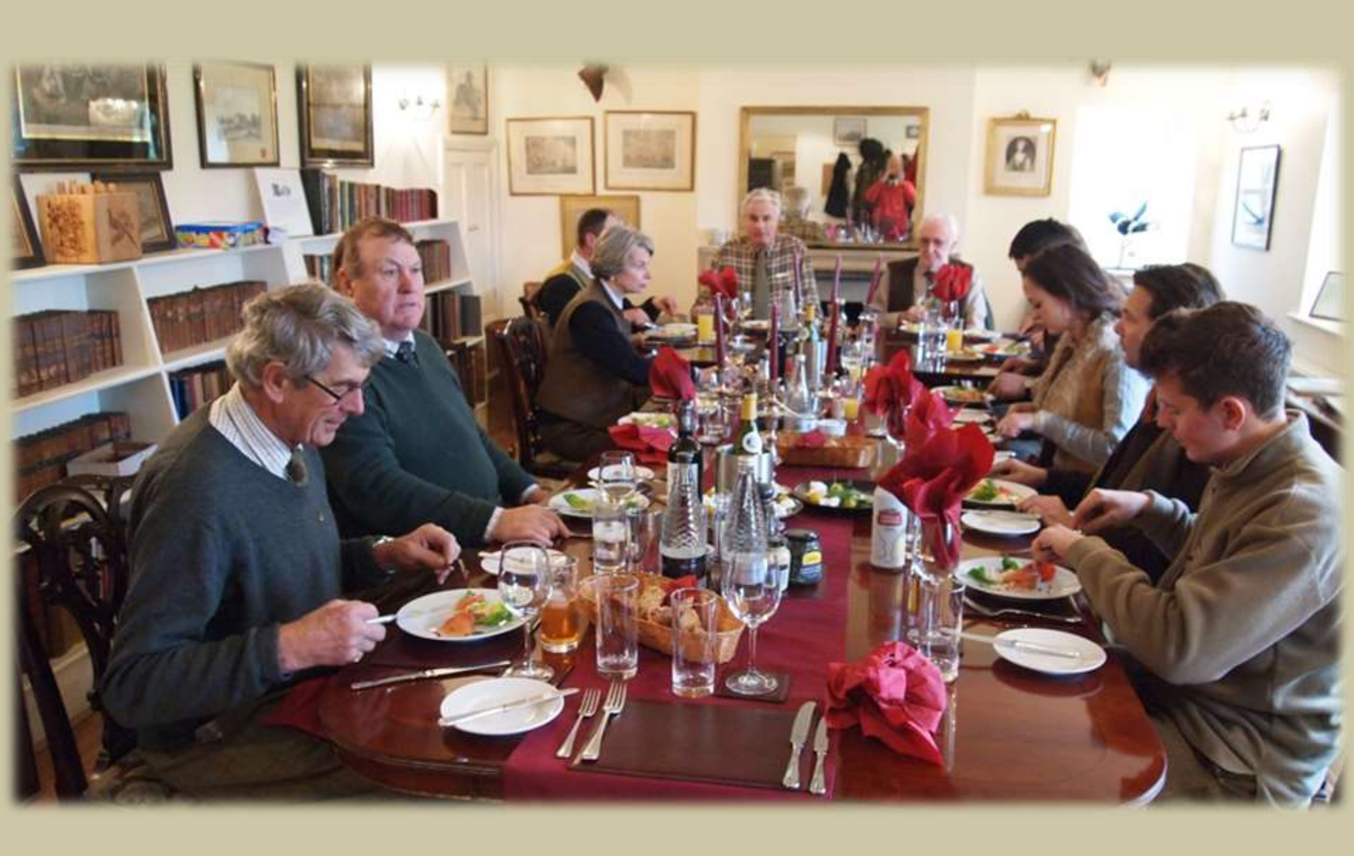
Lunch in der Lodge of Mountgarret