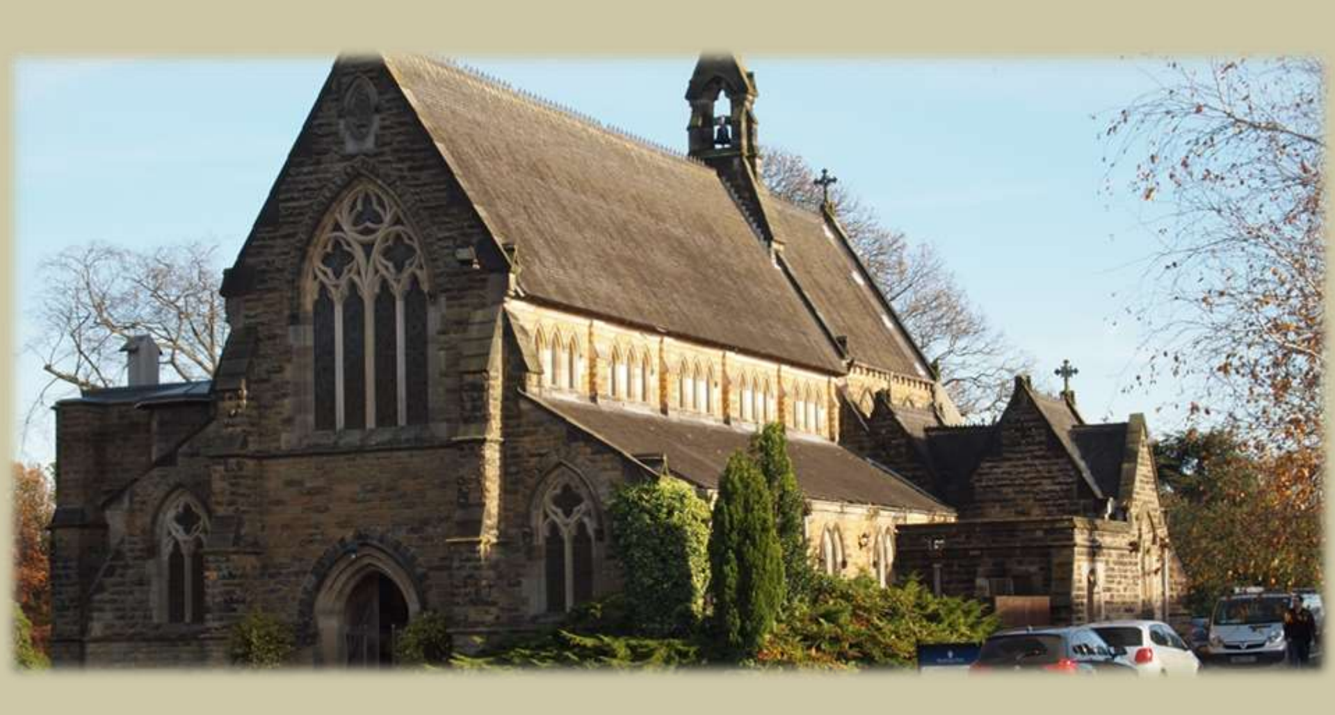
Church of Rudding Park Hotel