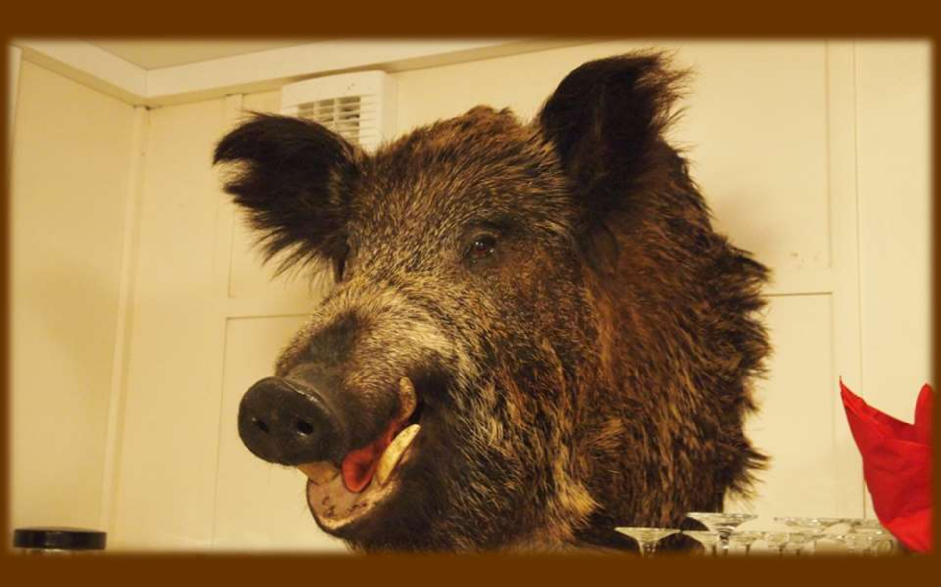
The Boars Head