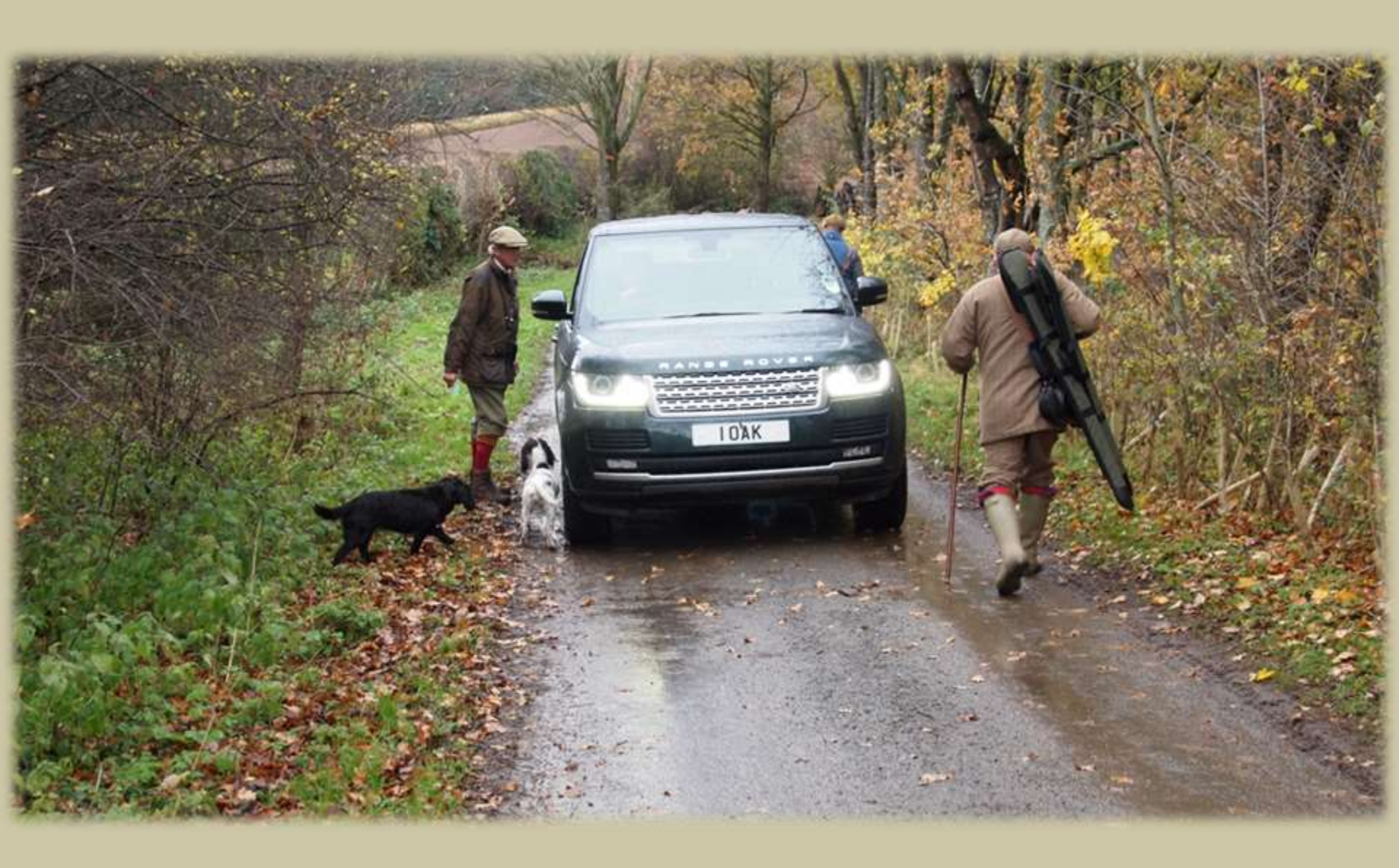
1. Jagdtag Mountgarret