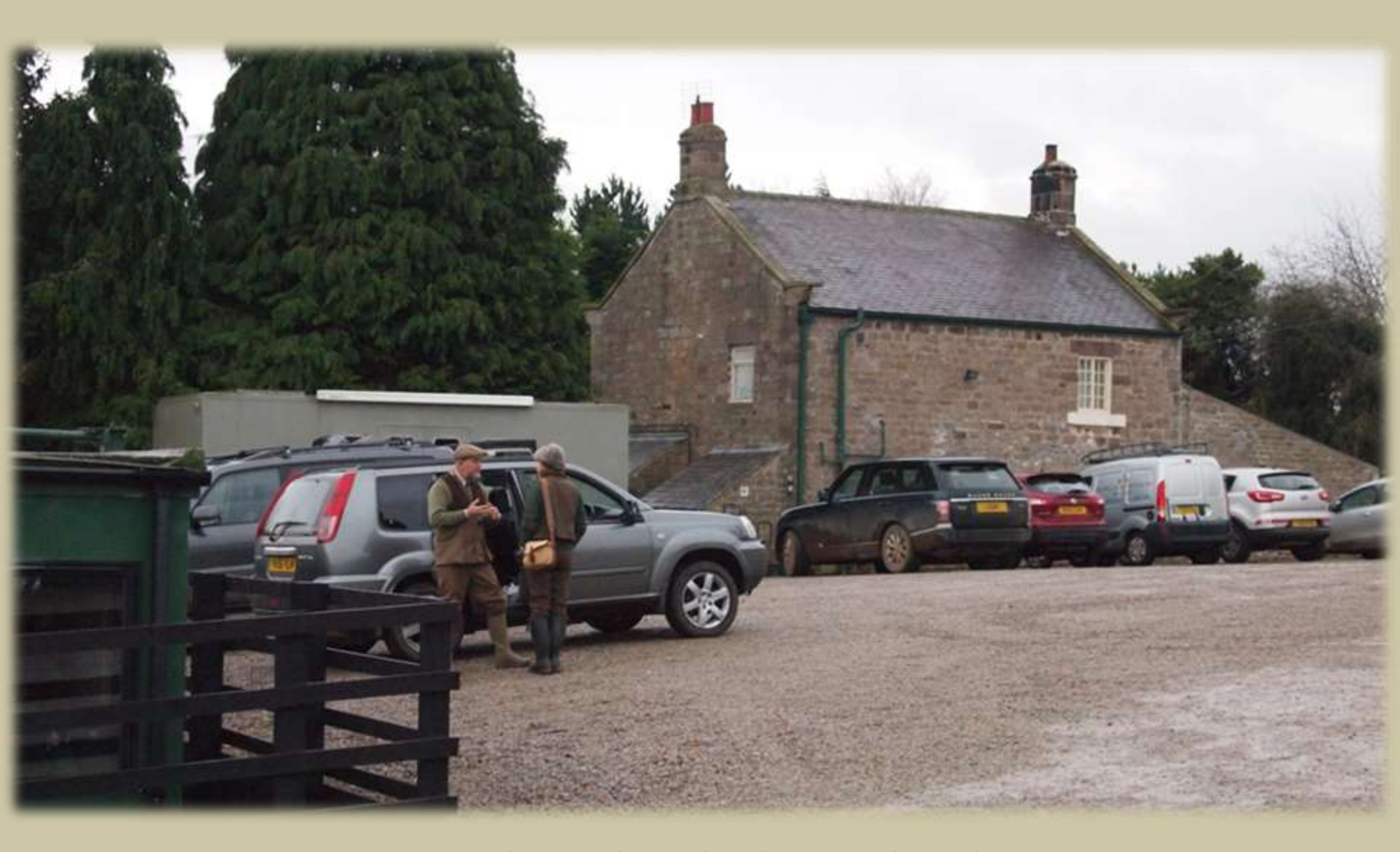
2. Jagdtag in Ripley Castle – Pheasant and Partridge