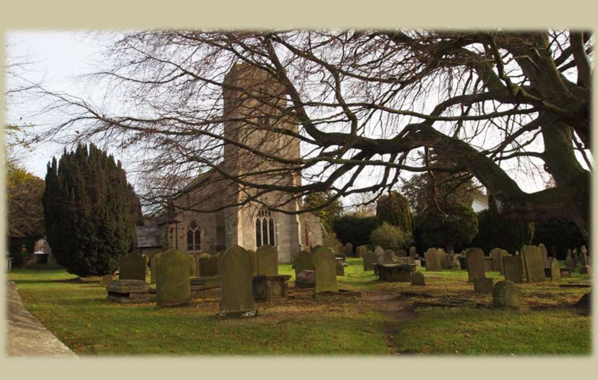
Church of Ripley