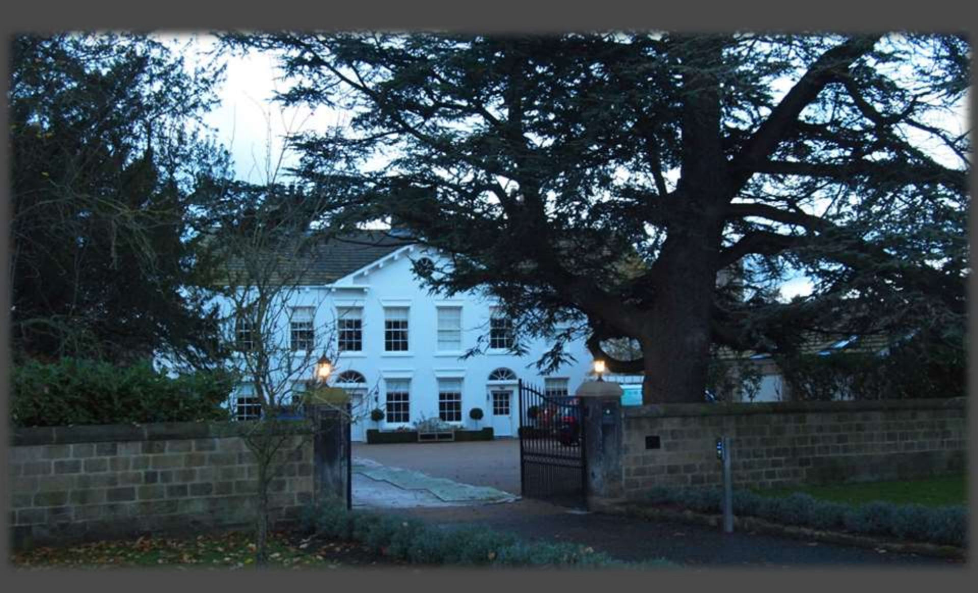
York House in Ripley